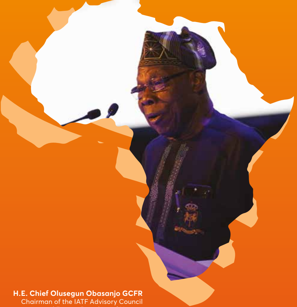
H.E. Chief Olusegun Obasanjo GCFR Chairman of the IATF Advisory Council and Former President of Nigeria

IATF2025 will provide a unique and valuable platform for businesses to access a single African market of over 1.4 billion people with a GDP of over US$3.5 trillion created under the African Continental Free Trade Area.